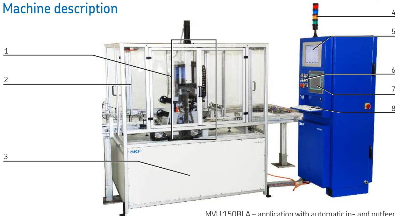
MVU 150BLA – application with automatic in- and outfeed