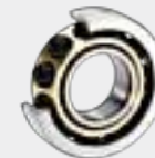
Bronze ball guided cage

7226PJDE-HYB#3 7228PJDE-HYB#3 7320PJDE-HYB#3 7322PJDE-HYB#3 7324PJDE-HYB#3